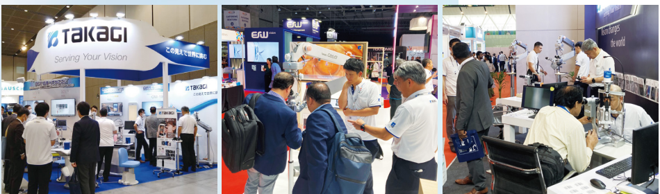
Meeting our international partners at exhibitions in Japan and overseas.

From left: Japan Clinical Ophthalmology 2023 (Tokyo, Japan) ESCRS 2024 (Barcelona, Spain) APAO 2025 (New Delhi, India)